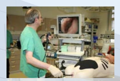
Endo-Trainer modification for NOTES