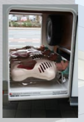
Up to 4 Endo-Trainer models on board