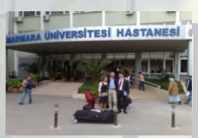
Two Endo-Trainer models packed up in two special bags