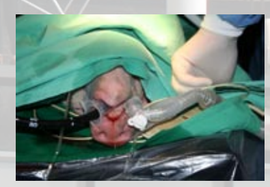
Live pig is being prepared for a training course, sometimes difficult to prepare and keep alive