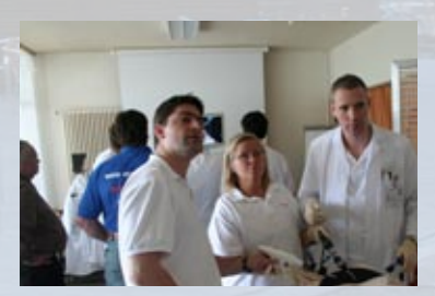
Clinical training group in action