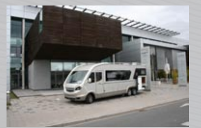
Starting from the ECE-Base in Erlangen to a workshop location