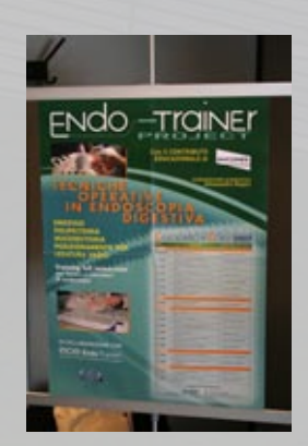
Italy 2007 as an example of an Endo-Trainer Tour

Convenient if a couple of dates can be combined on a tour, or if more than the normal two models are requested for a course or congress.