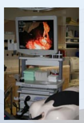
Clip on the bile duct